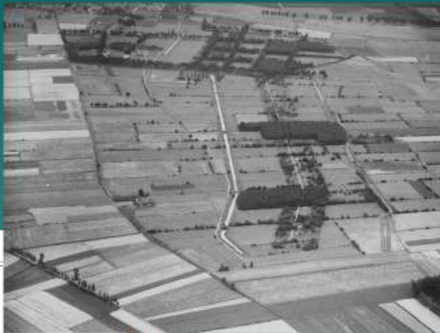
Akkertjes St Jansteen