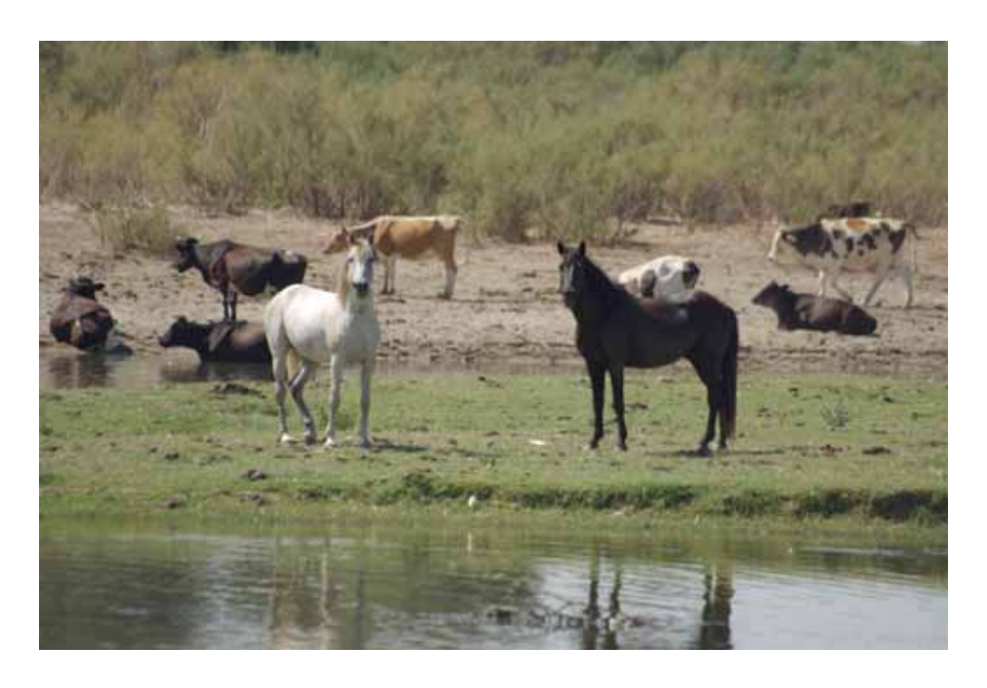
Picture 1.3 Stallions of the herd B (on the left) and C (on the right). (August 2008)