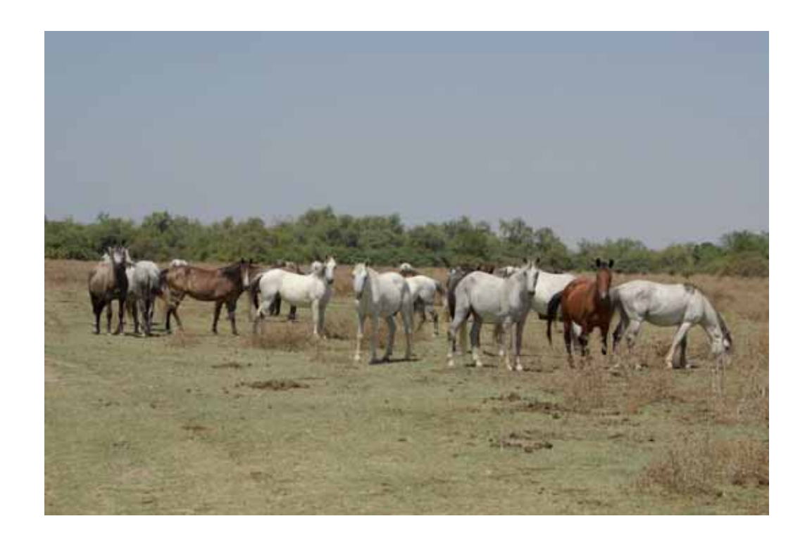
Picture 1.4 The horses of the Herd D1 in August 2008 in the location "sickled tree"