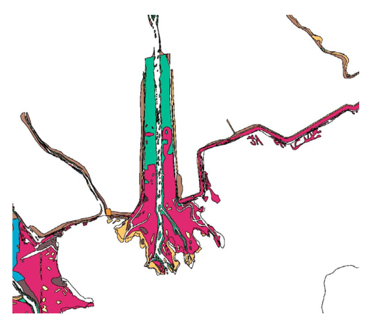
Charter 2.1 Flora types in the area of Axios river

With red colour: salt-friendly brushes (Sarcocornetea fruticosi) under the code 1420 NATURA 2000.