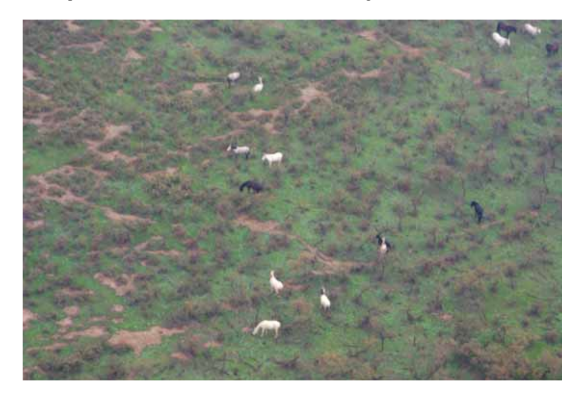
Picture 1.26 The herd E. In the center the subgroup Ea and members of the subgroup Eb on the right upper corner

Encompasses 11 horses, from which one is a weanling foal