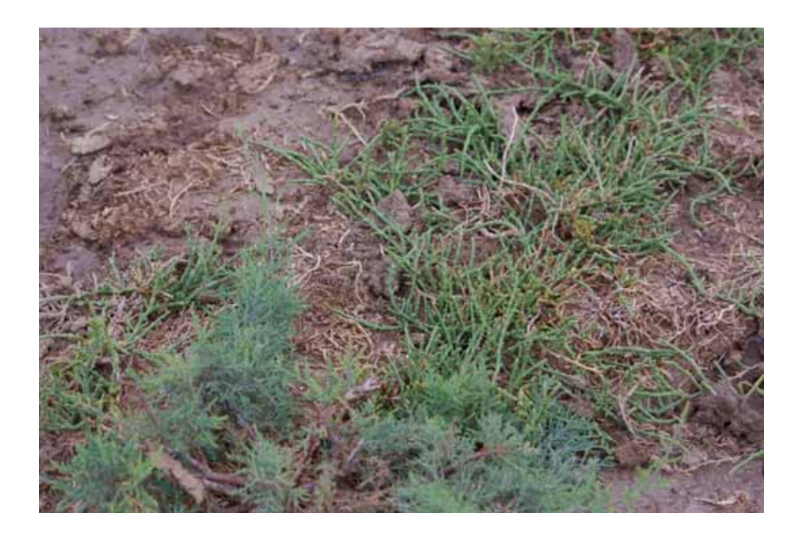
Picture 2.1 Characteristic vegetation in the area marked with red colour, shown in the charter 2.1

The large population of cattle in this area is the main cause of soil deterioration due to overgrazing and depression from their footmarks. In the fenced locations nourishing vegetation was found, which is evidence that cattle deteriorate the rest pastures of this region. Also sheep and goats graze in this area, which are food-competitors of horses. The existence of carnivores (wolves) does not seem to affect significantly the population of the horses.