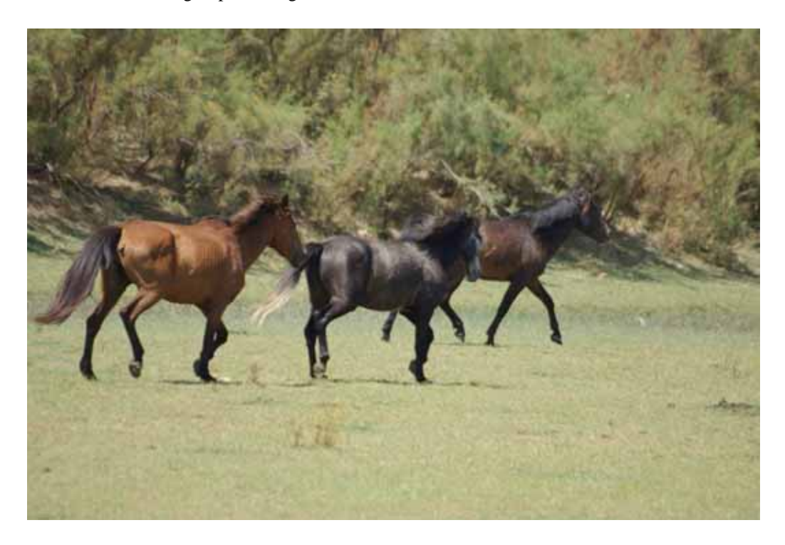
Picture 1.7 The subgroup D2. August 08, on an island in the bedriver.