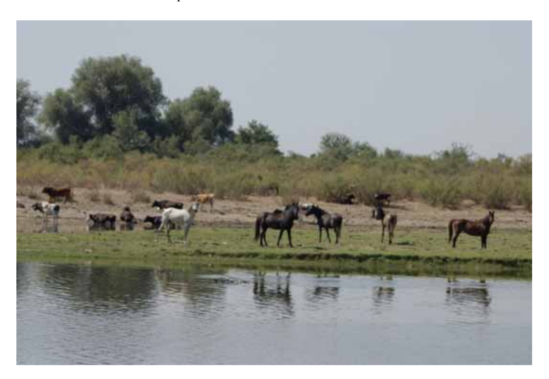
Picture.1.5. On the left the stallion of the herd B and the horses 12, 14, 15, and 16 of the herd C