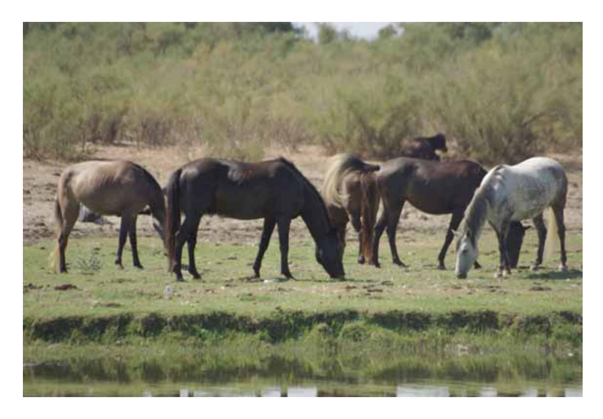
Picture 1.6. The herd C From the left: the horses 14,12,16,15 and 13. September 08. Place channel.