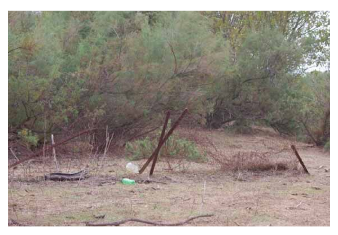
Picture 2.6 Wire fencing in the area that is a possible cause of injury of horses.