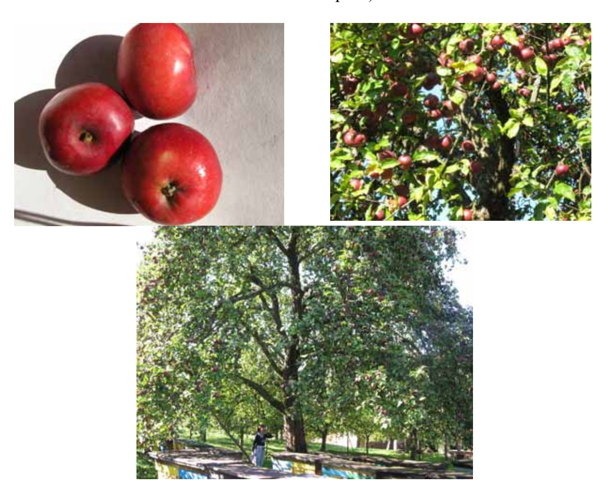
Gipsy (Krasnaja korolyka in Moldavia, Czigany alma, Fekete masanczi, Brauner Matapfel.)

This is a very old sort that has been saved in separate private gardens. Some trees are over 80 years old. The trees have strong force of growth with widely pyramidal crown. This sort is frost-hardy not demanding to soils and enters early in fruiting. The fruits have winter terms of ripening, average size and trivial rounded form. The rind is smooth, brilliant, fully covered with raspberry red blush on which background are selected more dark spots. The fruit is covered with thin mucus. The pulp is light-rose, dense, juicy, has sweetly sour taste. The patellula is wide with wrinkles. The bowl is half-closed. The peduncle is thick, short with a bulge on the end. The crater is large deep slightly ferruginous. The fruits are ripening at the end of September.