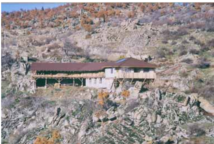
Rescue Centre for rare Karakachan breeds in Vlahi, Bulgaria