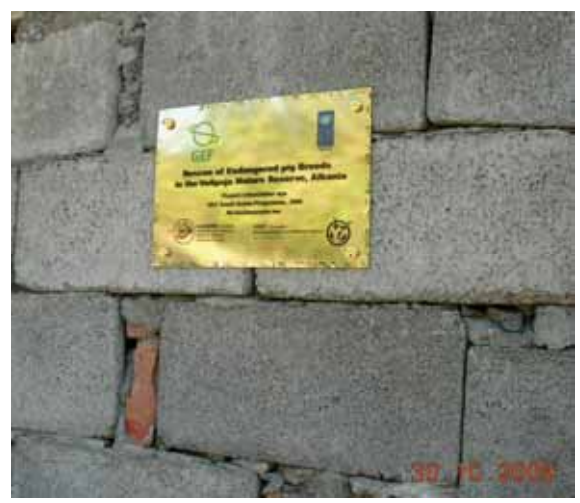
The new stable