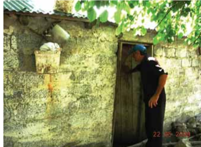
The renovation stables