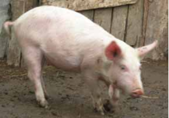
Animals purchase with the financial support of project